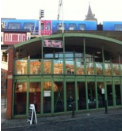
Cask 29 Liverpool Rd