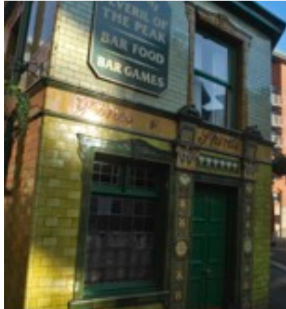
Lass O'Gowrie 36 Charles St