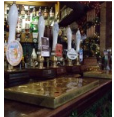
Marble Arch 73 Rochdale Rd